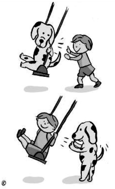
Figure 1. An example of a picture pair used in the sentence-picture matching task and sentences of the various types that match the upper picture

Topicalization et ha-kelev ha-ze menadned ha-yeled acc the-dog the-this swings the-boy